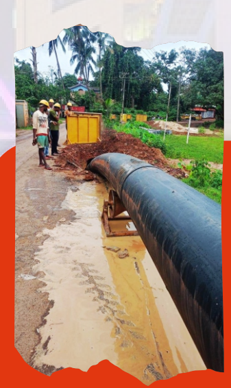
Sewer Pipeline Network

We prioritize safe and healthy working conditions and promote environmental protection.