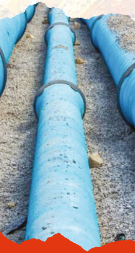
Water Pipeline Network